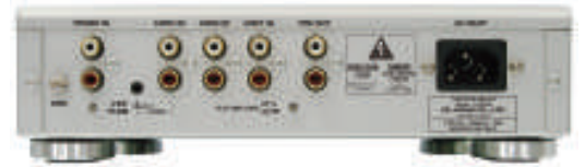
----- Back -----