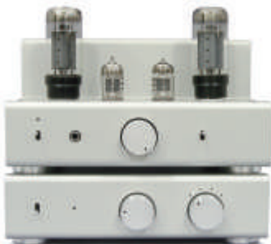
---- Combination with TU-8200 ----